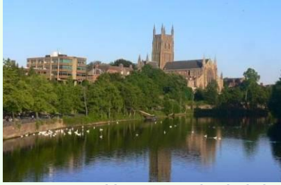
Worcester: tuition centre and cathedral