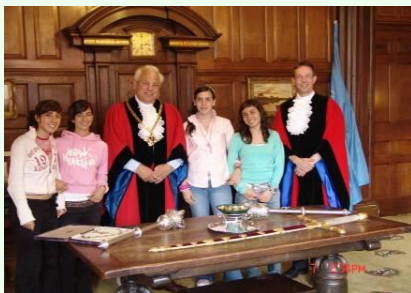
Reception with Mayor