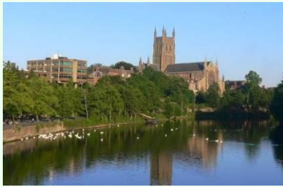
Worcester: tuition centre and cathedral