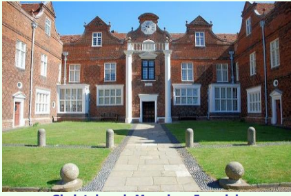
Christchurch Mansion, Ipswich