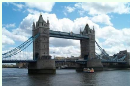
Excursions to London