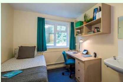
A typical university bedroom