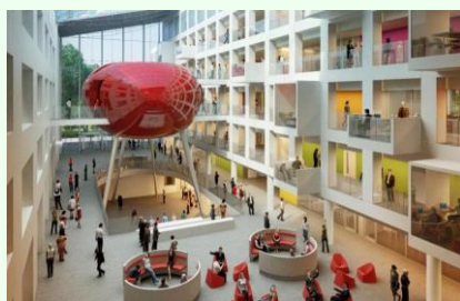
Southampton Solent University