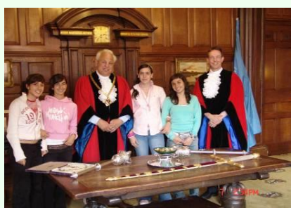
Reception with Mayor