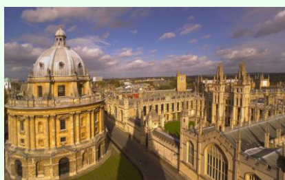
Excursion to Oxford