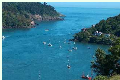
Excursions to the coast

Prices for airport transfers are available on request. (Bristol is the nearest airport.)